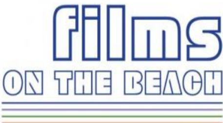
Click logo for more information.