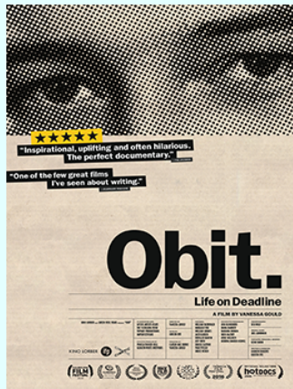
Click image for more information.