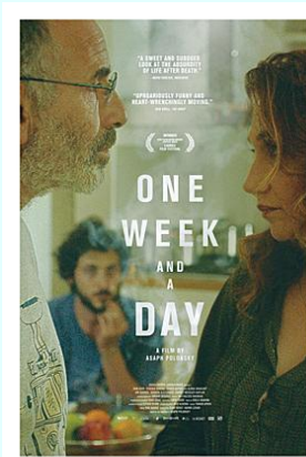
Click image for more information.