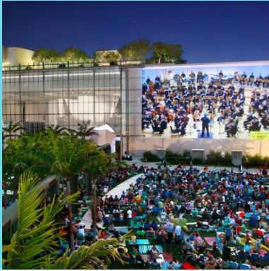
Click image for more information.